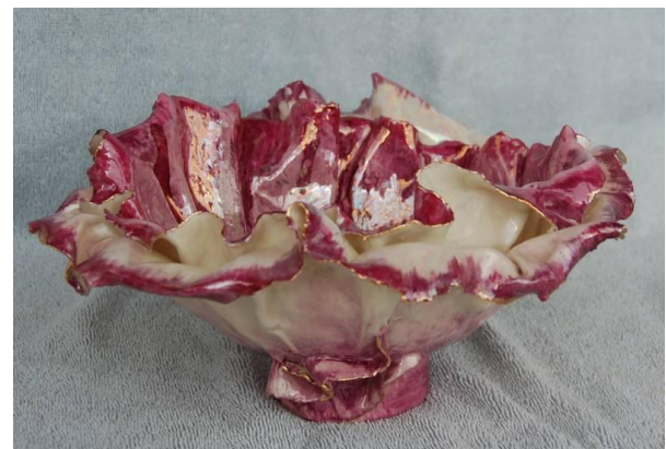
This delicate, intricate, multi-leafed, convoluted hand-built porcelain “Violet Art Bowl” is one of the many sophisticated pieces which Betty is displaying at the Gallery